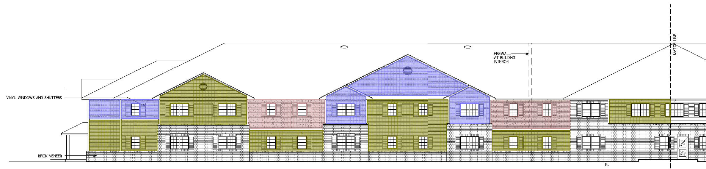
01 BACK ELEVATION A5.02 SCALE: 1/8" = 1'-0"