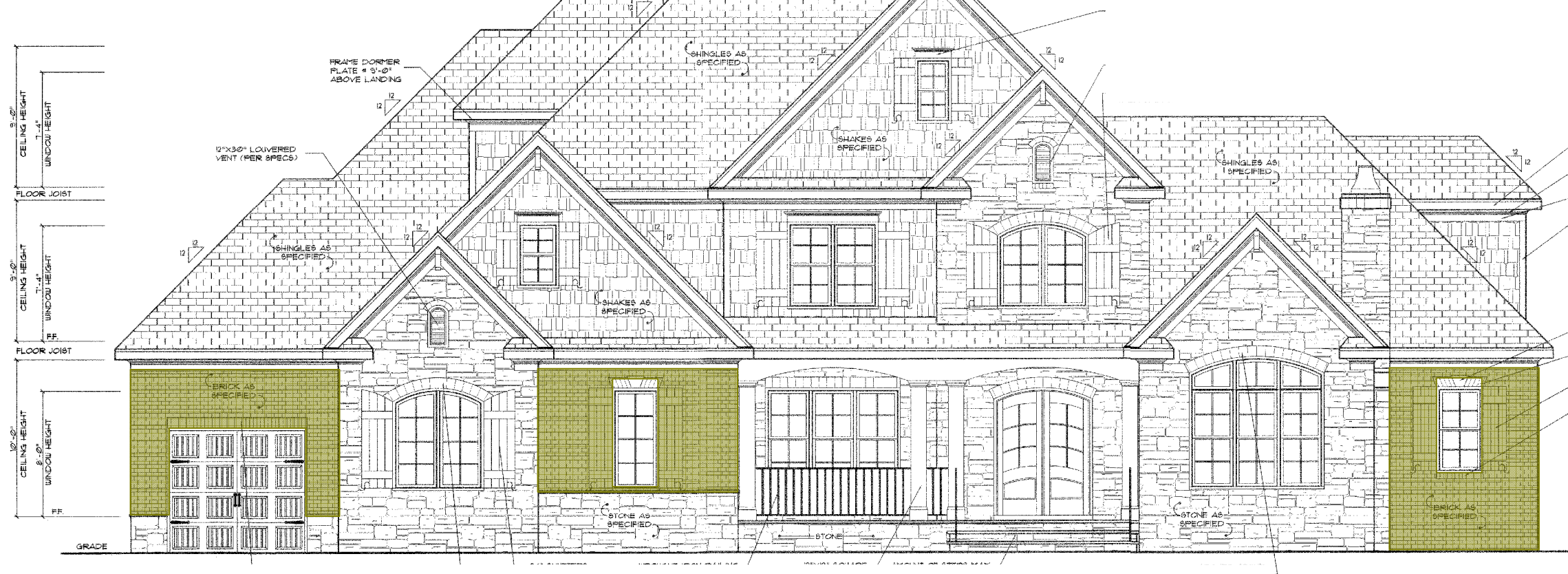
FRONT ELEVATION SCALE: 1/4"=1'